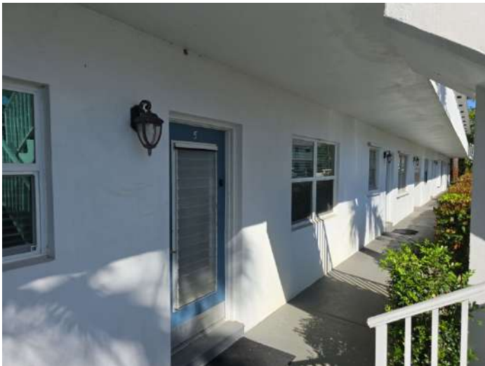
DOOR & WINDOWS