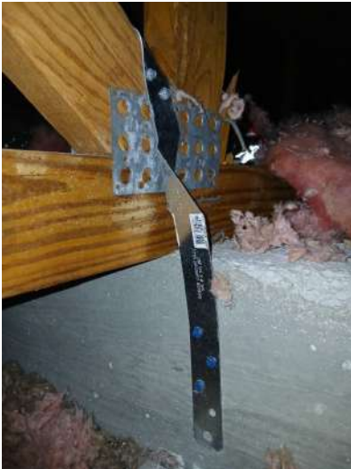
SINGLE WRAP - FRONT