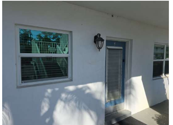
DOOR & WINDOWS