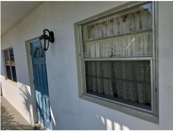
WINDOWS & DOOR