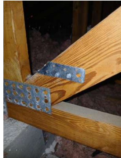
SINGLE WRAP - REAR