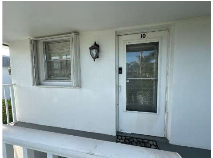
DOOR / WINDOW