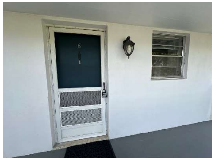
DOOR / WINDOW