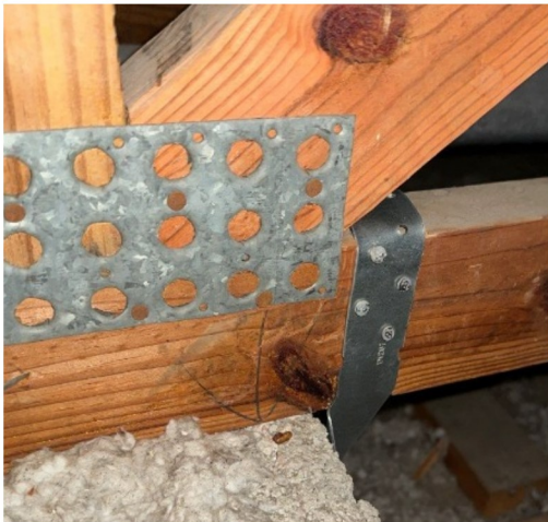
SINGLE WRAPS - FRONT