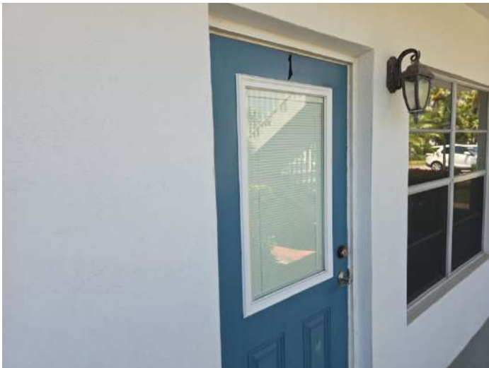
DOOR & WINDOW