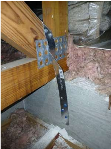
SINGLE WRAP - FRONT