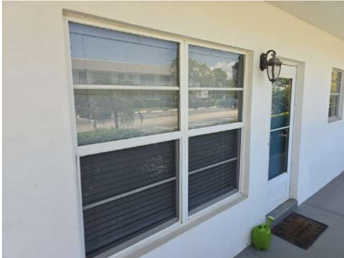
WINDOWS & DOOR