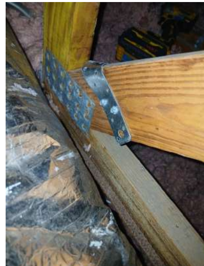
SINGLE WRAP - REAR