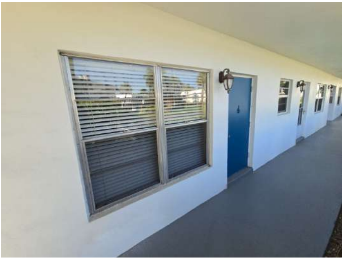
WINDOW & DOOR