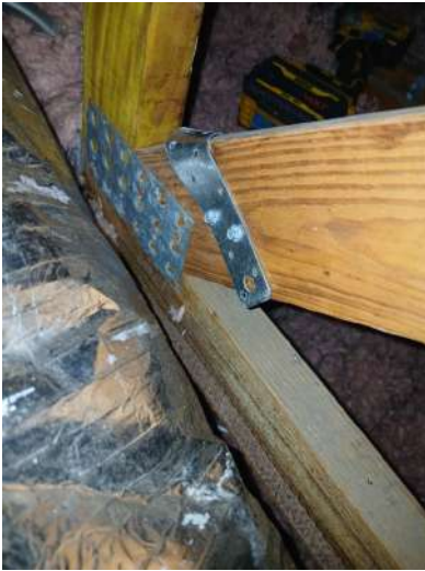
SINGLE WRAP - REAR