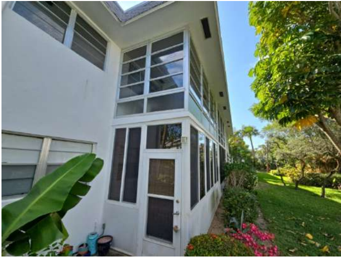
PATIOS & WINDOWS