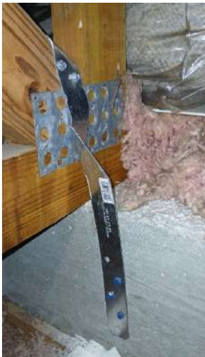
SINGLE WRAP - FRONT