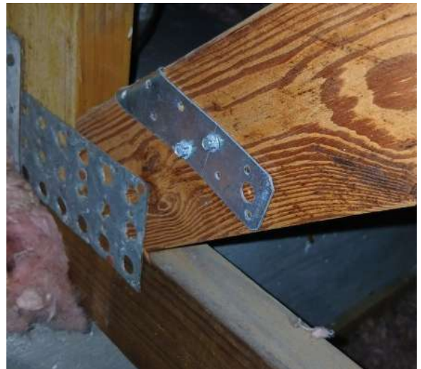
SINGLE WRAP - REAR