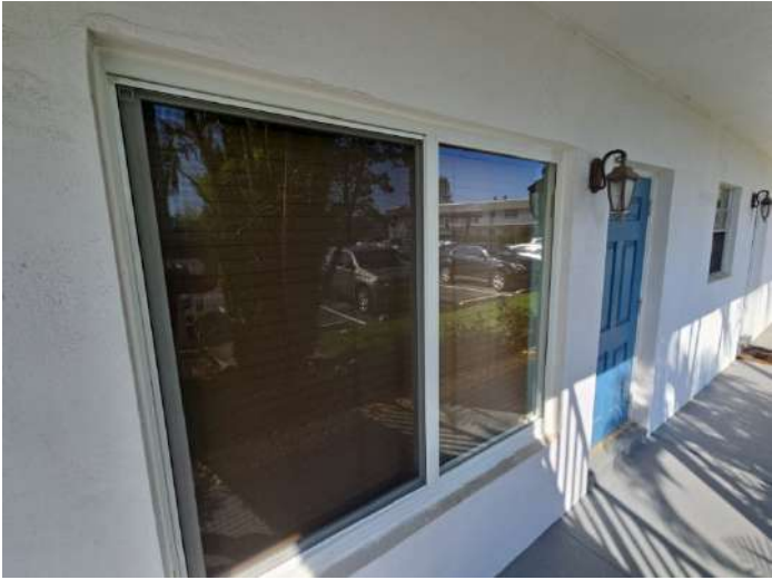
WINDOW / DOOR