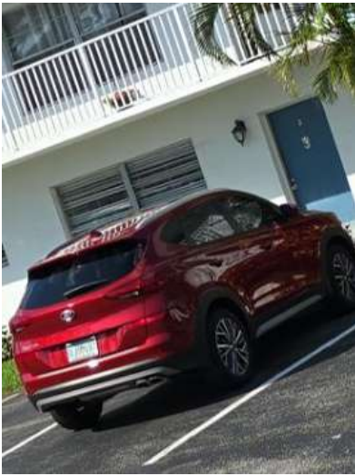
DOOR / WINDOW