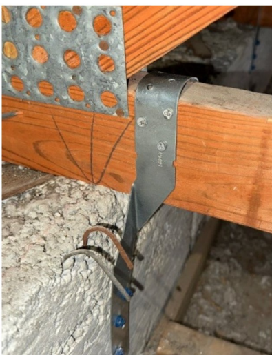
SINGLE WRAPS - FRONT