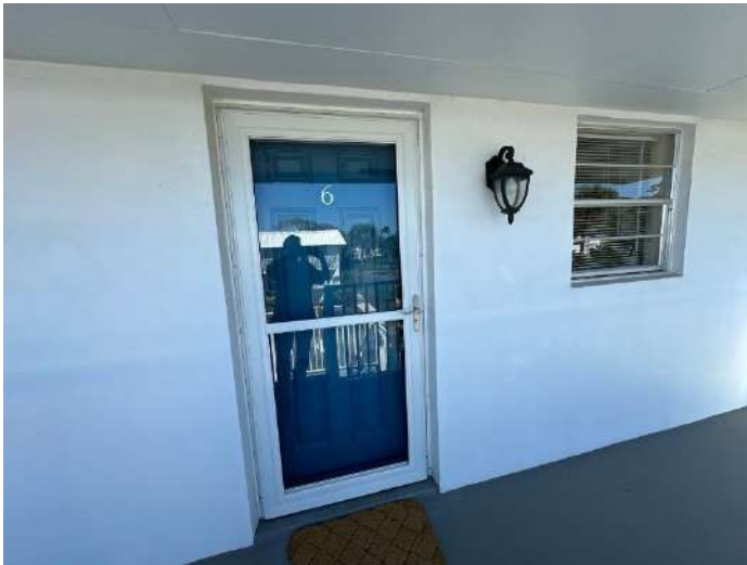
DOOR / WINDOW