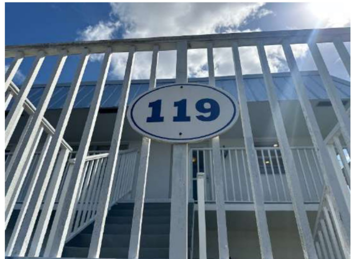
BUILDING # 119