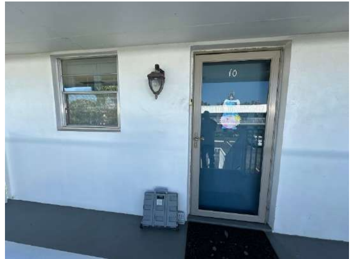
DOOR / WINDOW