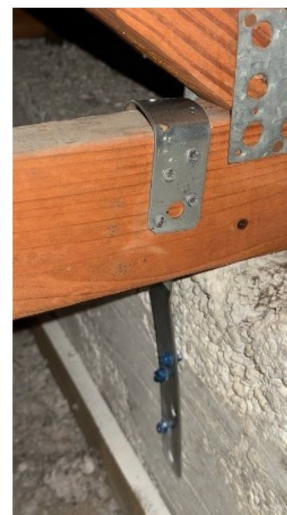
SINGLE WRAPS - REAR