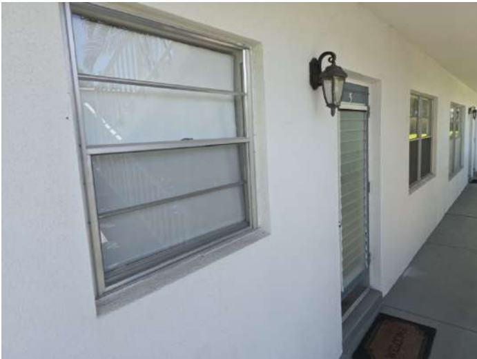
WINDOWS & DOOR